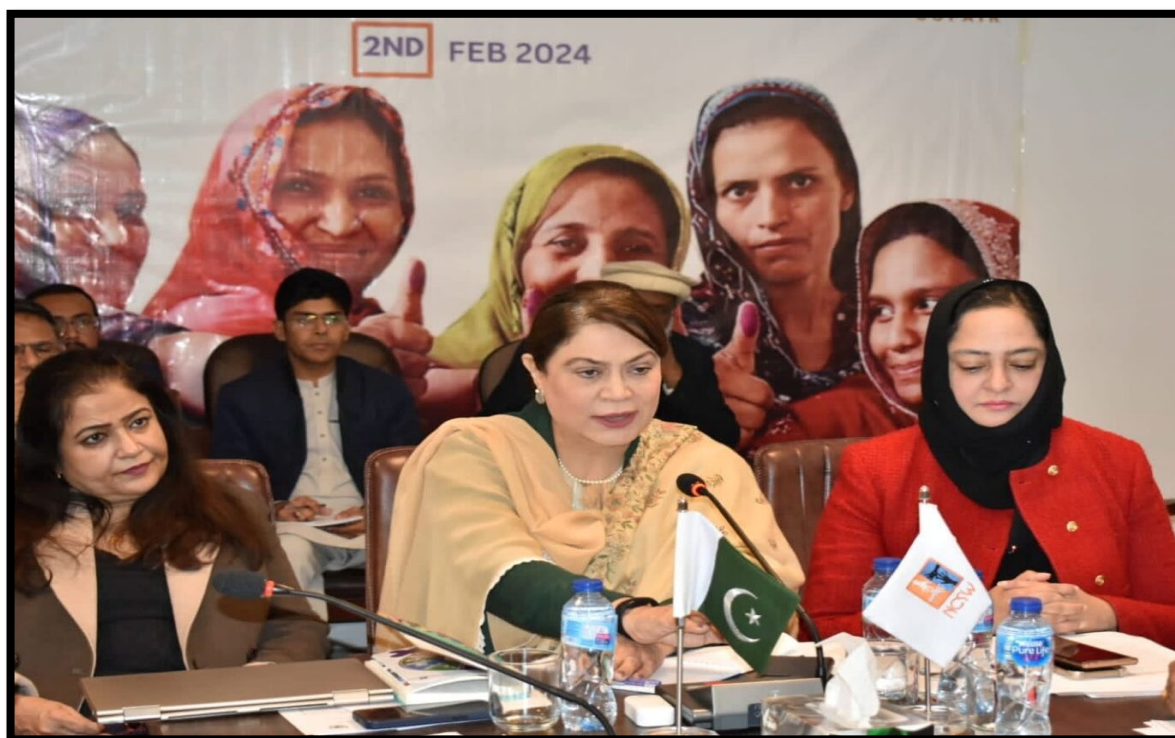
Speakers at a seminar organized by the NCSW in collaboration by COPAIR on Friday, 2 nd February' 2024